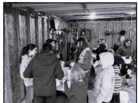
Members of the Park Ridge Wilderness Scouts & Princesses assemble baskets for the Pantry's program to provide goodies to clients' children.