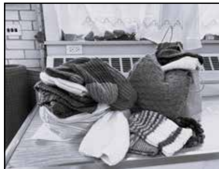
The Nimble Thimbles knitting group that meets at the Irish American Heritage Center donated a big batch of winter wear to the Pantry, which was quickly given out to clients.