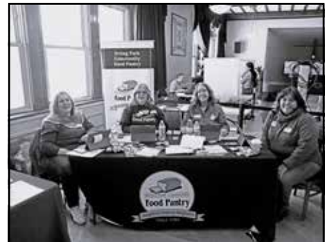
Pantry volunteers answered questions at a recent event for Chicago's CityKey card program at the Irish American Heritage Center.