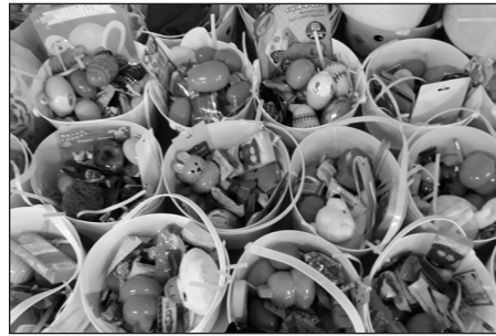
The Pantry has started its program to provide baskets to clients' children 12 years old and younger in March prior to Easter.