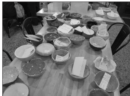
Disney II Magnet High School's Ceramics class and J.T.'s Genuine Sandwich Shop held a Pantry fundraiser where customers purchased ceramic bowls filled with soup.