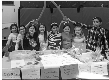
Brownie Girl Scout Troop #25375 at Belding Elementary School raised money for the Pantry with a Maker Fair in late November.