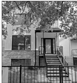
SOLD 4253 N Avers