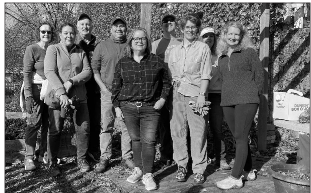
The end-of-season cleanup at Three Brothers Garden was held November 4.