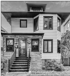
UNDER CONTRACT 4037 N Hamlin

NEIGHBORS ARE GETTING TOP DOLLAR FOR THEIR HOMES WITH MY UNIQUE 5-STEP MARKETING PLAN & OUR STRATEGY.