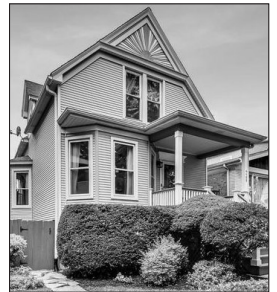
SOLD 4122 N Lawndale