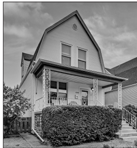
SOLD 4310 N Springfield