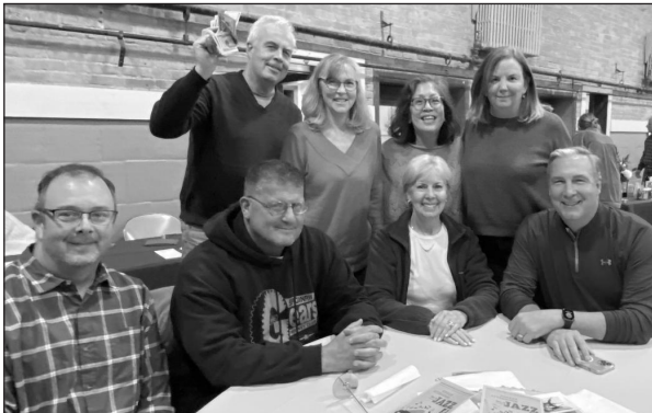
Team “Gang of Four et al.” were the winners of Carlson’s 19th Trivia Night, held November 10.