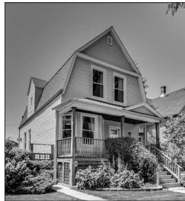
SOLD 4340 N Springfield