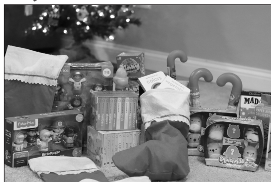
The Pantry is collecting small toys from its online registry to give out to clients' children 12 years old and younger in December.

The meal ingredients we provide to all our clients, in a special distribution that day, comprise meat, stuffing, vegetables, potatoes, gravy and dessert. This is in addition to the regular array of groceries they receive during our four distributions this month (we are closed December 27 and January 3).