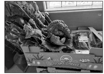
Merchant Park Community Garden donates produce each week to the Pantry from its garden at 3568 N. Keeler Ave. These baskets came in one week in August.