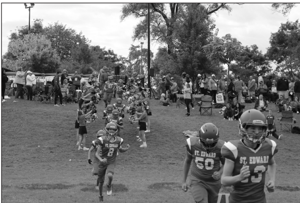
The St. Edward varsity football team runs onto Gompers Park field for St. Ed's homecoming.