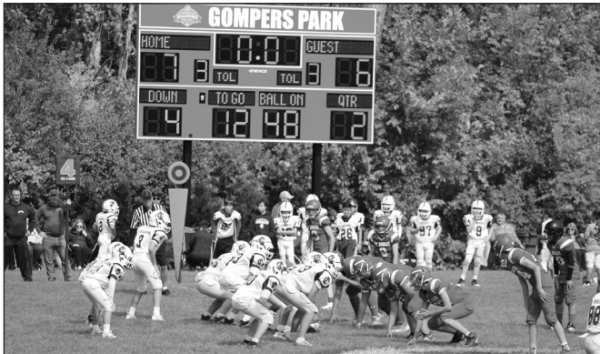
The St. Edward varsity football team takes on the IC Cowboys during St. Ed's homecoming at Gompers Park field.