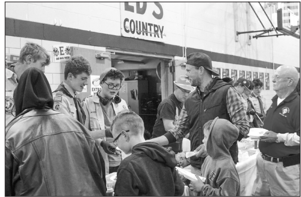
St. Edward Scouts serve pig roast plates to families at Harvest Bash.

culminated with a homecoming Saturday, featuring a Mass, parade, football game, and homecoming dance. We were so happy to bring the community of alumni in North Mayfair and beyond back together to celebrate their connection to the school and Parish.