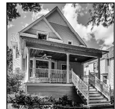
SOLD 4110 N Avers

With my unique 5-step marketing plan, sellers are getting top dollar for their homes.