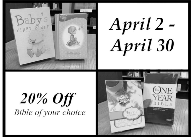
We have Spanish, Chinese, Russian, Polish, Bulgarian, Romanian materials