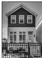
SOLD 4901 W Dakin