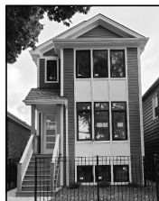
SOLD 4309 N Bernard