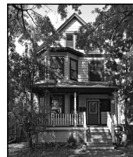
SOLD 4240 N Monticello