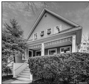
SOLD 4019 N RIDGEWAY

Homes in our neighborhood are selling fast. And as Your Realtor, I want you to get the top sales price.