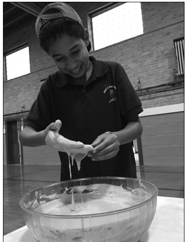
We've taken everything we've learned about having fun after school and rolled it into the MAP Summer Camp! Sign up for camp at carlsoncommunityservices.org/event/map-summer-camp/

Still looking for a great summer camp? The Magic After-School Place (MAP) is hosting a summer camp at June 28-July 23 from 9:00 am – 3:00 pm for 1st through 5th graders at 3938 W. Belle Plaine Ave. MAP Summer Camp will bring fun, creativity, and joy to your kiddos in a safe, socially distant environment. Expect positive character development, science experiments, small group and Olympic games, water days, arts and crafts, and more! Tuition is just $160/week and tuition assistance is available. Registration closes soon! To learn more and to register, visit CarlsonCommunityServices.org/events/ . Or contact Camp Director Rachel at mapdirector@carlsoncommunityservices.org .