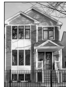
SOLD 3741 N DRAKE