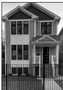
SOLD 3743 N DRAKE