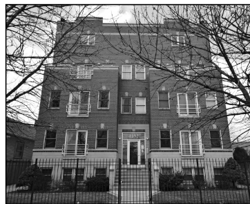
SOLD 4232 N HARDING 1N