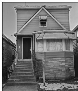
SOLD 4309 N BERNARD