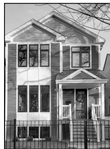
SOLD 3741 N DRAKE