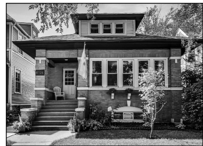
SOLD 4124 N SPRINGFIELD