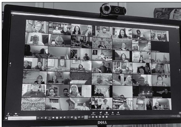
If you missed Carlson's Virtual Trivia Night in November, here's your chance to join the fun! We'll be back at it Friday, March 19th at 7 pm via Zoom. Visit carlsoncommunityservices.org for registration info.