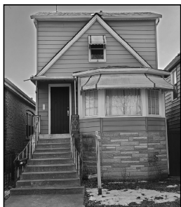
SOLD 4309 N BERNARD