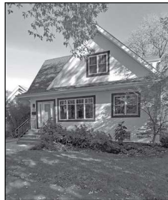
SOLD 4127 N LAWLER