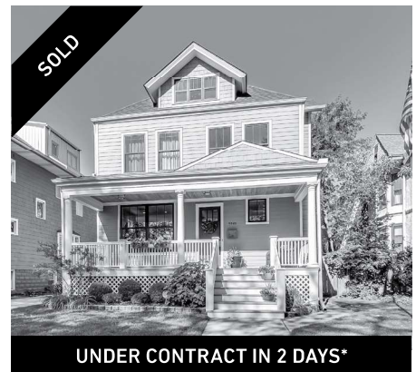
4138 N. Harding 3 bed/2.1 bath