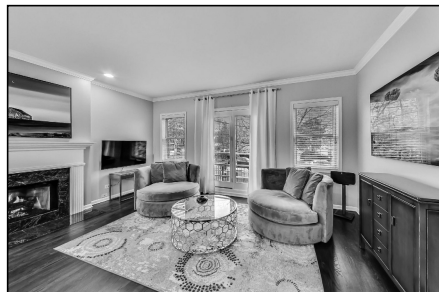
NEW ON THE MARKET - 4232 N HARDING UNIT 1N!

Very spacious 3-bedroom, 3-bath, 2800 sq ft condo! Gorgeous new kitchen cabinets, refinished floors, open layout... Contact Dorie for details!