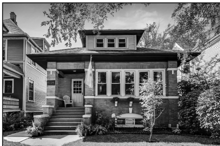
UNDER CONTRACT 4124 N SPRINGFIELD