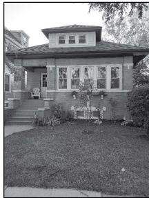
UNDER CONTRACT 4124 N SPRINGFIELD