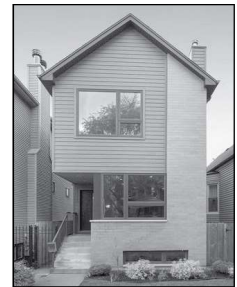
SOLD 4048 N TROY