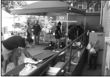
Client's food supplies are handed out to them through the Pantry's back door, where they are packed into wagons to deliver to clients' cars (unless they have their own shopping carts).