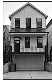
SOLD 4024 W BELLE PLAINE