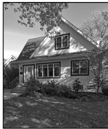
SOLD 4127 N LAWLER