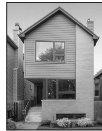
SOLD 4048 N TROY