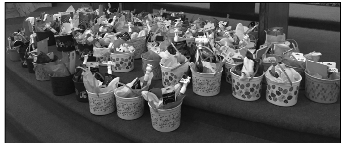
The Pantry is looking for donations of Easter baskets and items to fill them for its annual distribution in March and April.