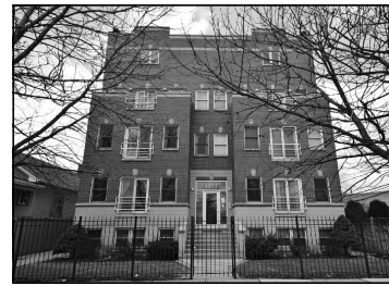
SOLD 4232 N HARDING