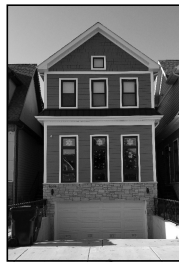
SOLD 4034 N HARDING