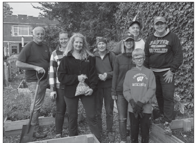
A fall garden clean-up took place in early October at Carlson Community Services' Three Brothers Garden. Opportunities to spend time in the garden will return in the spring!