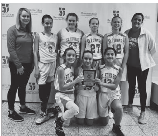
Congrats to the girls 7th grade basketball team achieving 3rd place in the Resurrection High School Tournament! They played an exciting game and won in overtime! We are BIG RED proud of you!

Discover all that St. Edward School has to offer. St. Edward School is a 2017 recipient of the National Blue