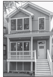
4017 N. Harding