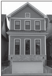
4034 N. Harding