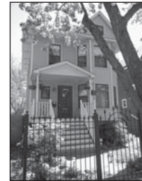
4137 N. Pulaski