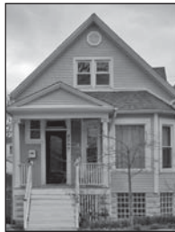
4249 N. Hamlin