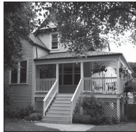
4239 N. Ridgeway