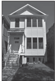
ALL SOLD – 4015 & 4017 N. Harding