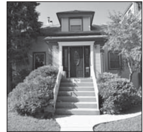
4034 N. Harding