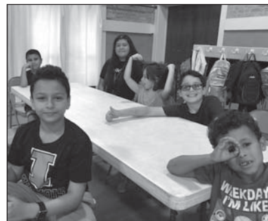
Magic After-School Place students and staff are excited for another school year!

Carlson Community Services' after-school program is in its 12th year of providing high quality, affordable after-school care for children attending Murphy and Belding Schools. This year, the Magic After-School Place (MAP) has enrolled 55