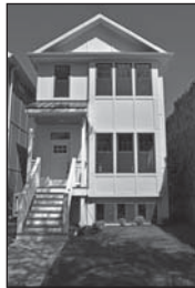
ALL SOLD – 4015 & 4017 N. Harding