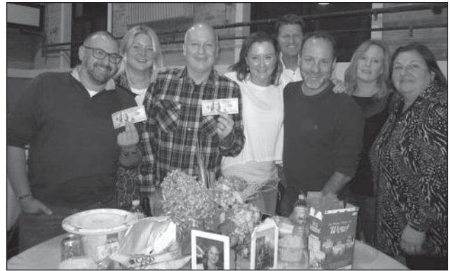
Carlson Trivia Night will be held Friday, Nov. 2 at 7:00 pm at Irving Park Lutheran Church Gym. Pictured are the winners of the 2017 contest.

Carlson Community Services is a 501(c)(3) non-profit that helps at-risk kids succeed with The Magic After-School Place (MAP), provides vegetables to people in need