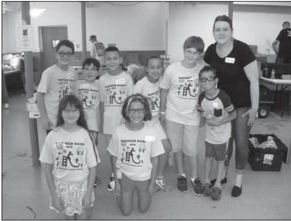
Eight campers in the Irving Park Lutheran Church's Summer Camp volunteered at the Irving Park Food Pantry in August, helping out at several stations and impressing everyone with their cheerful attitudes and willingness to pitch in.

small donation). You also can sign up to receive our Breadcrumbs e-mail newsletter. We appreciate all your support in ensuring we live up to our motto of being "Neighbors Helping Neighbors!"