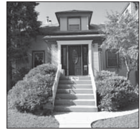
4034 N. Harding