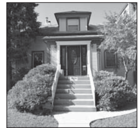
4034 N. Harding