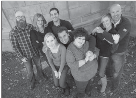
An Octave Above will perform a holiday concert on December 10th at 2 pm at Irving Park Lutheran Church.

The Irving Park Fine Arts Committee will present a free holiday concert featuring An Octave Above on Sunday, December 10th at 2:00 p.m. An Octave Above, one of the hottest