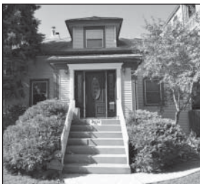
Under Contract - 4034 N. Harding & 4249 N. Hamlin