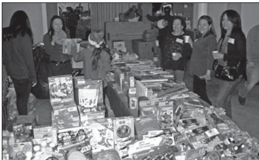
Volunteers prepare the stocking-stuffers and book table for clients during the Pantry's 2016 holiday program. Books often are in short supply.

The deadline for contributing toys is Friday, December 15th. Volunteers are needed to collect toys, organize the toy room, and help with toy distribution on December 20th. Please contact Sara Yost at sara.yost74@gmail.com.