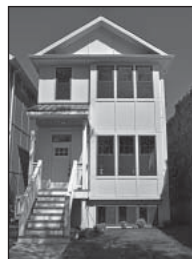
SOLD - 4015 N. Harding & 4017 N. Harding