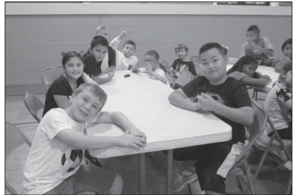
Ready for fun (and homework) at the Magic After-School Place