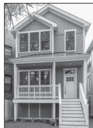
SOLD - 4017 N. Harding