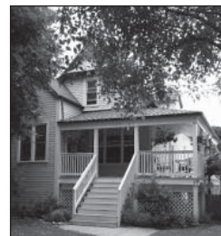
SOLD - 4239 N. Ridgeway