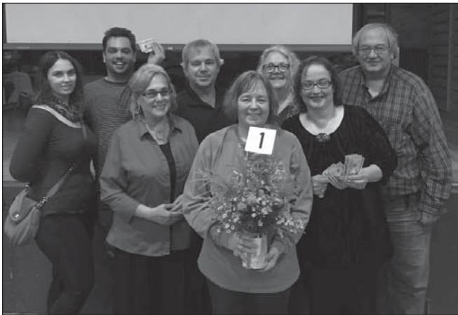
The Bole team took home the prize winnings and glory at Trivia 2016

the Irving Park community with programs that enrich lives through education, culture and service.