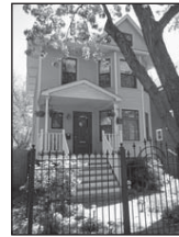
SOLD - 4137 N. Pulaski