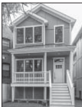
FOR SALE - 4017 N. Harding