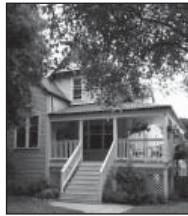
UNDER CONTRACT - 4239 N. Ridgeway