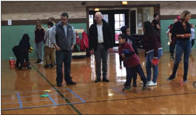
Adult mentors from Schurz High School's buildOn program joined their teen mentors at Carlson Community Services' after-school program for a carnival in April.

Carlson Community Services' Magic After-School Place (MAP) is brimming with activity and energy every afternoon. Fifty children from Murphy and Belding schools are enrolled in MAP, an after-school program which provides neighborhood working parents with affordable after-school care.