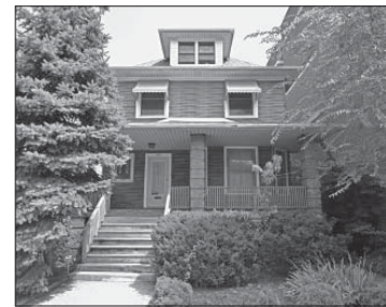
SOLD - 4129 N. Pulaski