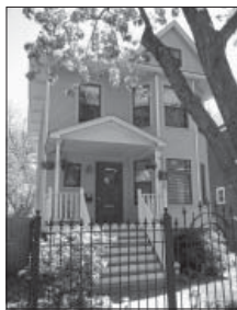
SOLD - 4137 N. Pulaski