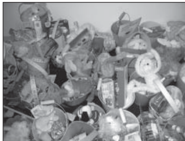
The Pantry is looking for donations to its Easter program for clients' children.