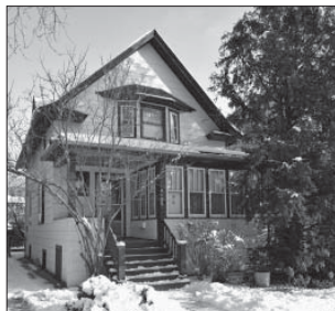
Under Contract - 4129 N. Springfield