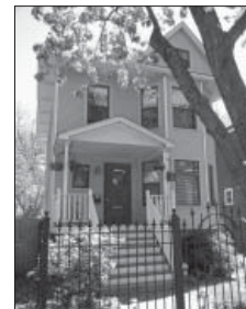
SOLD - 4137 N. Pulaski