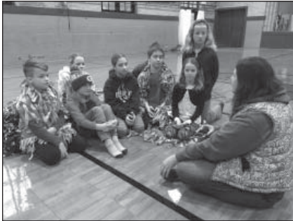
Neighborhood kids listen attentively during a Martin Luther King Day of Service held at Irving Park Lutheran Church Gym.

In honor of Dr. Martin Luther King Junior's birthday, a group of service-minded kids gathered at the Irving Park Lutheran Church Gym on Martin Luther King Day. Among several service projects tackled that day, kids worked on