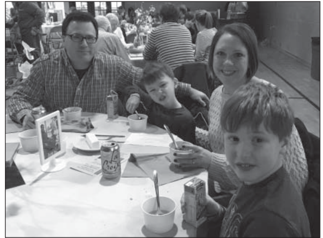
Bring the family to Soup & Bread for Carlson on February 12th.

MAP serves 50 kids from Murphy and Belding schools, the majority of whom come from low-income households. MAP's affordable tuition and engaging programming keeps kids safe and offers peace of mind to working parents. For more information or to schedule