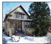
Under Contract 4137 N Pulaski