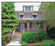
SOLD 4129 N. Pulaski

I can help you get the best price for your home with my proven 5 step marketing plan.