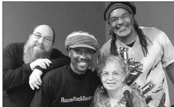
Roots Rock Society will perform at IPUMC on December 18

Soup & Prayer on Mondays at 11:30 am. Everyone is welcome to this brief space providing time to pause to remember the sacred in the midst of this busy season of advent. Prayer begins at 11:30, followed by a simple lunch of soup and bread. The last Soup & Prayer is December 19.