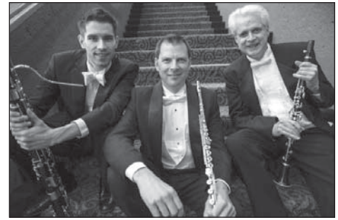
The Allegro Trio will perform on October 2nd.

affordable. Equally important, children receive homework help and tutoring, gain leadership skills and participate