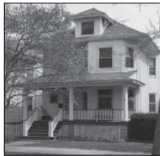
SOLD - 4115 N. Springfield