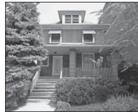
FOR SALE - 4129 N. Pulaski

A lot of buyers are looking for a home in our neighborhood.