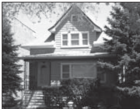
SOLD - 4017 N. Harding