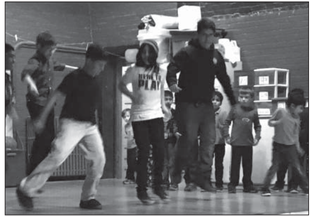
MAP kids break out their dance moves for the Third Annual Talent Show.

The Magic After-School Place (MAP) held its third annual talent show on December 18th. The acts included comedy (knock-knock jokes), magic tricks, singing and dancing. Family members and friends were amazed at the MAP kids' talents!