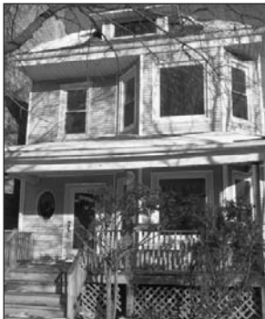
4904 W. Byron