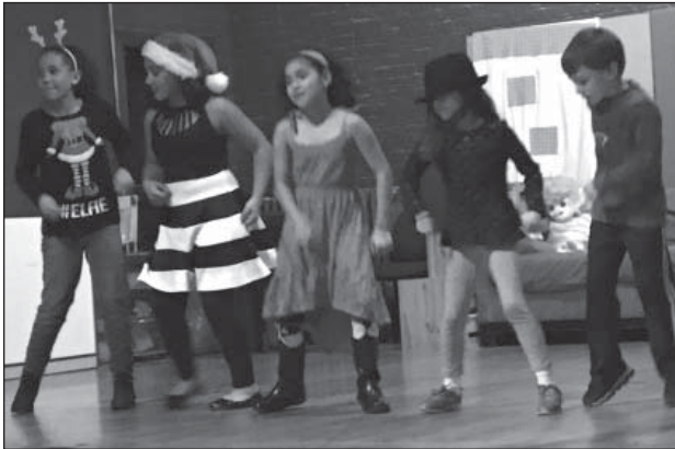
It's the Whip and Nae Nae at the MAP Talent Show!

The Magic After-School Place (MAP) held its third annual talent show on December 18th. The acts included comedy (knock-knock jokes), magic tricks, singing and dancing. Family members and friends were amazed at the MAP kids' talents!