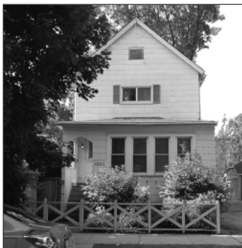
4253 W. Cullom