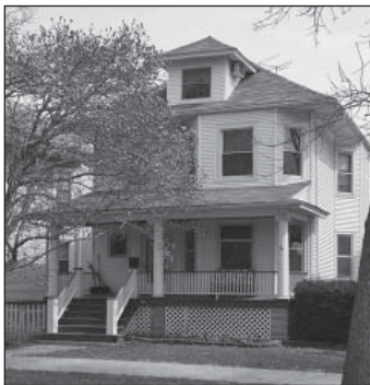
4115 N. Springfield