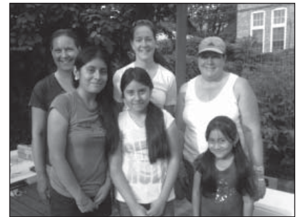
Two sets of three sisters helped harvest at Three Brothers Garden this summer, prompting the organizers to consider a name change to Three Sisters Garden!

Although the start of the season was wet and cool, hot and sunny weather in July and August has produced a bounty of vegetables at Three Brothers Garden. Through the end of August, nearly 500 lbs. of vegetables have been donated