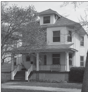
4115 N. Springfield