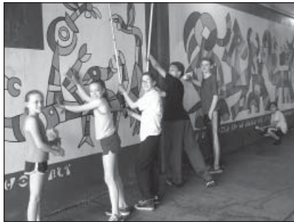
Girl Scout Troop 21326 organized a community-wide "Clear to Path to School" which took place on May 17.

On Sunday, May 17th, Disney II students and community members came out to clean the path between the Kedvale and Lawndale Disney II campuses. Volunteers scrubbed murals under the Kennedy/Pulaski viaducts, picked up trash, raked up debris and swept the area clean. Girl Scouts also planted three beautiful planters right next to the Pulaski/Irving Park exit.