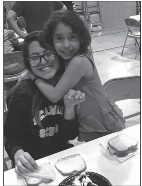
The Magic After-School Place held its first Spring Break camp in April. 28 students participated. All had fun!

Carlson Community Services, a 501c3 neighborhood not-for-profit, sponsors the program. For information, contact Liz at lizmills@carlsoncommunityservices.org or 773-398-6766.