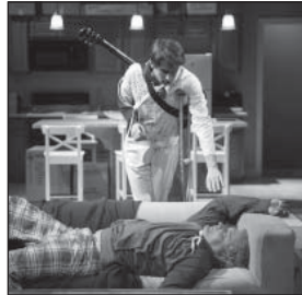
A scene from End Days.

"End Days" Runs through April 26th! It's the end of the world! Maybe. At least some members of the Stein family think so, and in this time of existential need each member turns to his own spiritual counselor. But with Jesus, Rabbi Baumbach, and Stephen Hawking amidst, might the Steins also find comfort in one other? WCP is located at 3014 W. Irving Park Rd. For dates and times, call 312-374-3196 or visit www.windycityplayhouse.com .