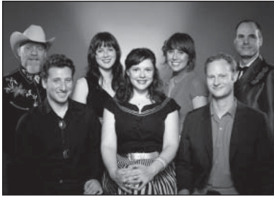
Golden Horse Ranch Band will perform at Filament April 17.

Filament Theatre Ensemble invites the community to the first EARTH FEST – a one weekend festival celebrating sustainability, community development and the one and only Earth we have. Festival