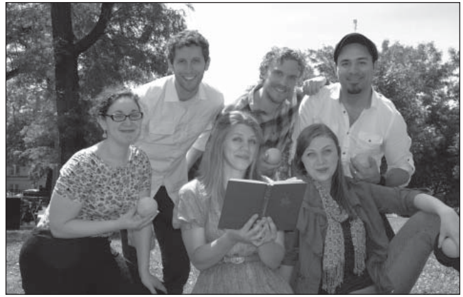
Filament players, actors and directors will create and perform for Sustain-36 on April 19.