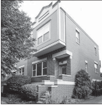
3443 N. Lawndale