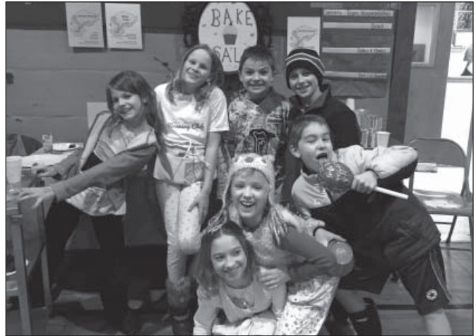
Even the neighborhood kids got in the game, volunteering to sell drinks and bake sale goodies.

Here are some highlights from Soup & Bread for Carlson held March 1st.