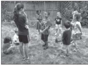
Magic Mushroom students enjoy the outdoors.

Register now for the 2015 Magic Mushroom Summer Program at Irving Park Lutheran Church, now in its 40th year! Call the church office at 773-267-1666 or visit www.iplc.org to download a brochure and enrollment form. You can also pay your tuition