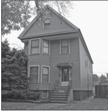
4112 N. Harding