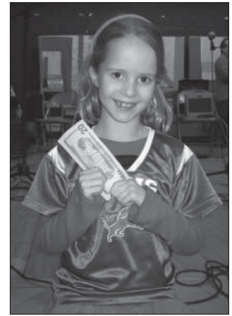
The winner of the Heads or Tails game at Soup & Bread held on Sunday, March 1st.