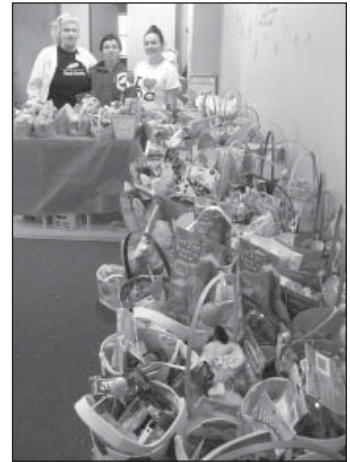
Pantry volunteers gave out Easter baskets to clients' children in 2014 and will continue the tradition this year.

We appreciate all of our volunteers who walked, drove and took the bus to open and work at the Pantry in brutal temperatures and deep snow, marking two months in a row the first week has been challenging. Their efforts, and yours in supporting us, ensured our clients received food to help their families make it through the month. It shows that we truly are Neighbors Helping Neighbors!