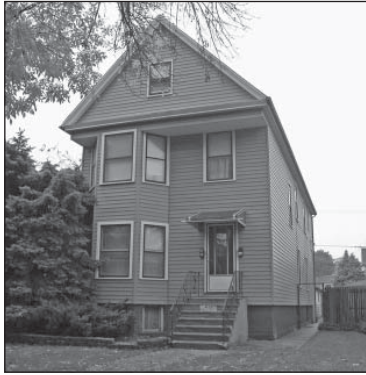
4112 N. Harding