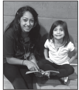
Reading is so much fun with a mentor from Schurz High School!

Lutheran Church gym, 4057 N. Harding Ave. Tickets can be purchased at the door and are $10 for adults, $7 for seniors, $5 for kids 3-12. Kids under 3 eat free!