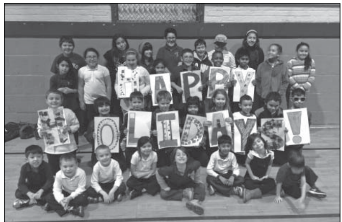
The Magic After School Place (MAP) students from Carlson Community Services created a banner and holiday decorations to help make the Pantry more festive during its Holiday Distribution on December 17th!

City Hall, Room 300 121 North LaSalle Street Chicago, Illinois 60602 (312) 744-7242