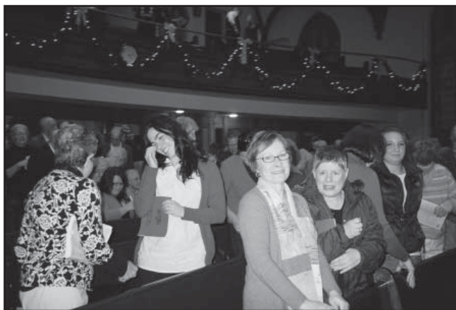
Irving Park Fine Arts Committee will present Sing-Along Messiah on December 7th at 3:00 p.m.