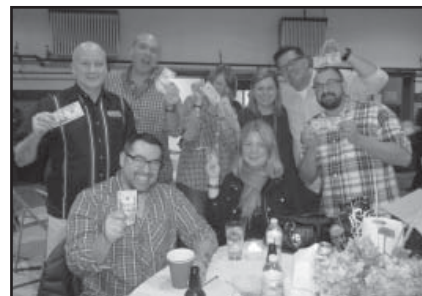
The winners of Carlson Community Services' Trivia Night --Table #3.

Thanks to everyone who participated in Carlson Community Services' October Trivia Night to benefit Carlson's programs. From players to sponsors to raffle and beer donors, we are grateful for your support! And of course to Irving Park Lutheran Church for allowing us to use the gym for the evening.