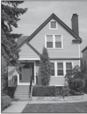
4039 N. Harding