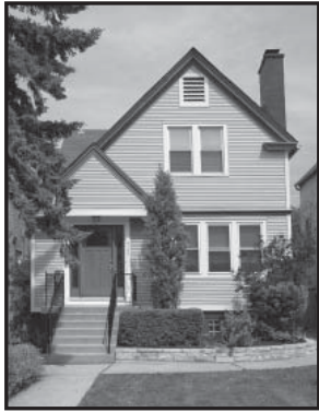
4039 N. Harding