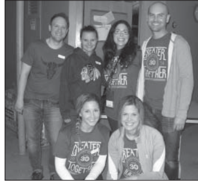
Thank you to the folks at Fossil who volunteered to work at the Pantry in April. They put together food bags, cut up boxes and helped out in other departments all day. This is the second year they've volunteered.