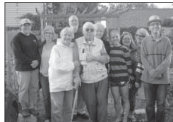
Volunteers gather for the weekly harvest at Three Brothers Garden.

Three Brothers Garden closed the 2013 growing season with a whopping yield of 815 lbs. of vegetables. Now in its fifth year of operation, the garden is a partnership between Carlson Community Services and Irving Park