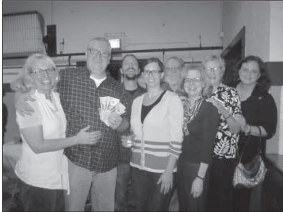
Top: The Gipsters pose with their $150 prize money. The Trivia Night champs generously donated $100 back to Carlson Community Services.

Thanks to the 18 teams that came out for a fun and competitive Trivia Night on October 11th. Proceeds benefited Carlson Community Services programs. Carlson helps at-risk kids succeed with The Magic After-School Place (MAP), reduces hunger and beautifies our neighborhood with Three Brothers Community Garden and makes fine arts affordable and accessible through the Irving Park Fine Arts Concert Series.