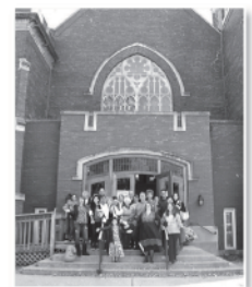
125 years and counting ... proud that our doors remain open to all.

Special worship and celebration Sunday, November 17 at 10 a.m.