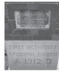
Cornerstone for new church.