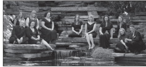
VOX 3 Collective will perform December 15th at Irving Park Lutheran Church

The Irving Park Fine Arts Committee will present VOX 3 Collective in a program titled "Half Spent Was the Night" on December