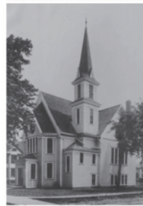
Original First Methodist Episcopal Church on "North Forty-Second Avenue".