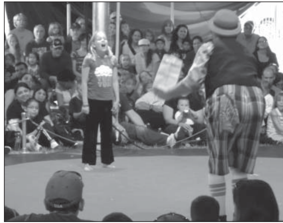
A young volunteer helps a clown demonstrate his pitching skills at the 2012 Circus in the Park.