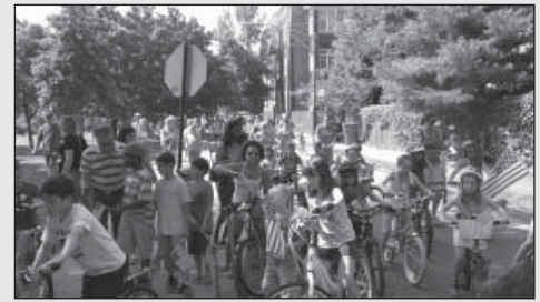
There was a terrific turnout for the 4th of July Parade at Independence Park, and this year, the weather such that it would've made Goldilocks smile...not too hot, not too cold, just right!