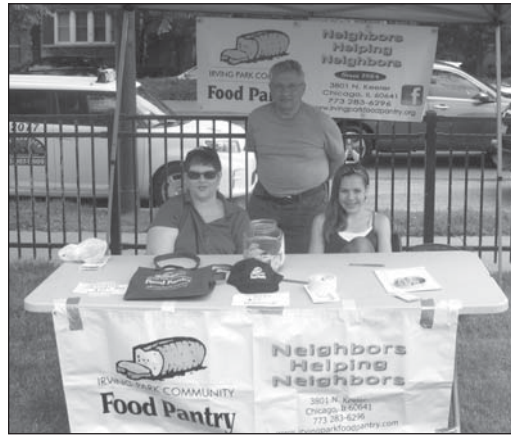
Stop by to talk with some of the Pantry's volunteers at the GIPNA Farmers Market on September 22nd and October 13th!