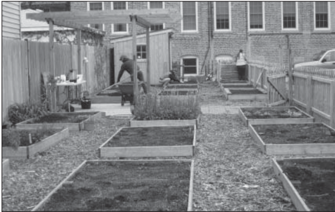
The first work day in Carlson's Three Brothers Garden will be April 13th from 9:00 to 11:00 a.m.

Three Brothers Garden will start the 2013 volunteer growing season with a general clean up, bed soil topping off, and lettuce and pea planting on April 13 from 9:00 to 11:00 a.m. Come one, come all!