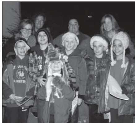
Young people from all over the neighborhood shared their voices in caroling to raise funds for Hands to Help Ministries!