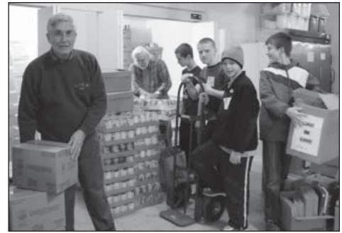
Volunteers help prepare the Food Pantry for the Christmas distribution in 2011. This year's distribution of a holiday meal to all client households will take place on December 19th.

Thank you for all of your donations and efforts on our behalf. We are proud to work with all of our neighbors to help those of our neighbors in need!