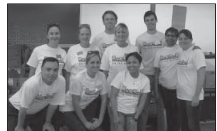
On September 12th, ten volunteers from MB Bank locations, gathered food for distribution, helped give out pet food and worked various stations.