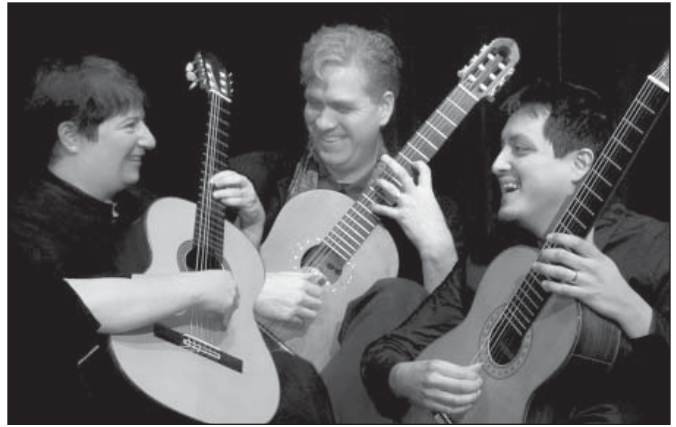
Avanti Guitar Trio.