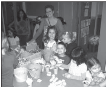
Volunteers and their children help prepare Easter baskets. More than 150 baskets were distributed last year.