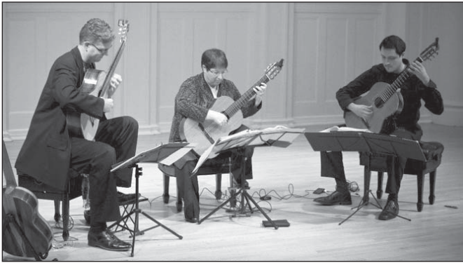
Avanti Guitar Trio will perform on February 26th.

Avanti Trio members graduated from some of the country's most prestigious conservatories and universities. Each has performed a a soloist throughout the country and all are currently teaching at Chicago area universities.