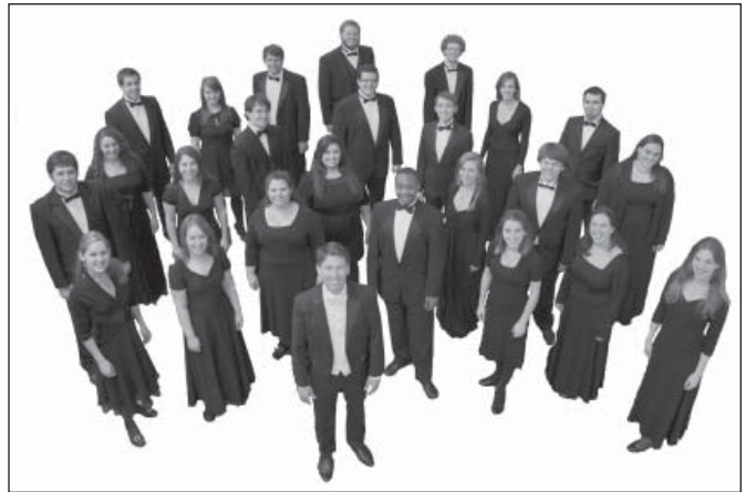
Plymouth State Chamber Singers will perform on January 26th.

Plymouth State Chamber Singers The Irving Park Fine Arts Committee is pleased to present The Plymouth State University Chamber Singers in concert Thursday, January 26th at 7:00 p.m. This 19-member group is an auditioned ensemble of university students majoring primarily in voice performance/pedagogy, music education, theatre, and music theatre. Plymouth State University is a small liberal arts school in the lakes region of central New Hampshire. The Chamber Singers have performed throughout the United States, Canada, England, South Africa, Vietnam, and most recently, Italy. The PSU Chamber Singers perform heartfelt, energetic and exciting programs of beautiful choral music from around the world. The Fine Arts Committee is delighted to welcome the Plymouth State Chamber Singers to Chicago.