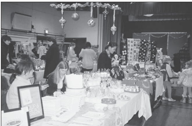
The West Walker Holiday Fair on Nov. 19 will feature the handmade works of 25 artists

The Holiday Fair is a fundraiser for the Three Brothers Garden, an organic food pantry garden in West Walker. Proceeds from table sales and a raffle featuring the works of participating artists will go to support the community garden, which is sponsored by Carlson Community Services. Vegetables raised in the garden are donated to the Irving Park Food Pantry.