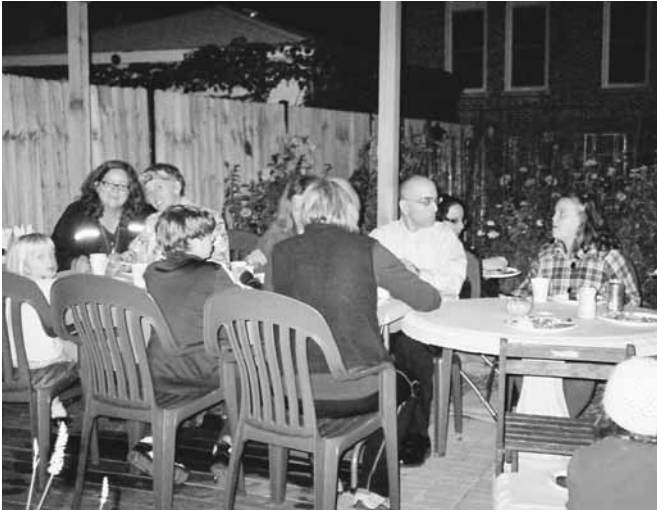
A Harvest Pot Luck was held in the Three Brothers Garden to celebrate the year's bountiful harvest.

to the pantry for distribution the next day. In addition to 20 raised growing beds, the garden features an ornamental gathering space and a pergola, providing a peaceful oasis on a busy stretch of Pulaski Road. All are welcome to enjoy the garden!