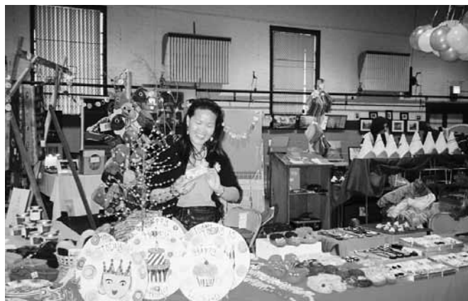
Shoppers found a variety of one-of-a-kind, handmade items at the 2009 West Walker Holiday Art Invitational.