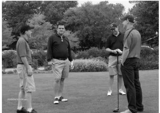
Participants in the sixth annual West Walker Cup at the Wilmette Golf Club size up the competition.

Like Odysseus, a West Walker champion may simply feel